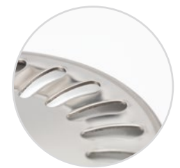
stainless steel grid 1.5 mm