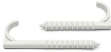
N1x25/75 • N1x25/95