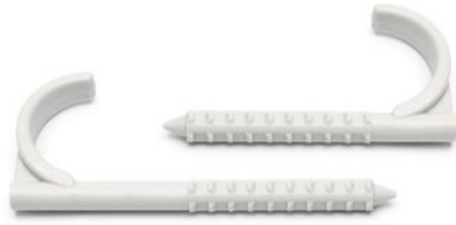
N1x32/75 • N1x32/95

Used for quick and easy installation of pipes, cable lines, pipe protective trims etc. Installed in drilled holes D 8 mm by use of hammering tools. Made of PA, max. thermal resistance 130 °C.