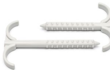
N2x25/75 • N2x25/95