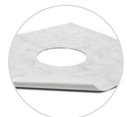
can be ordered with waterproofing membrane 391/3